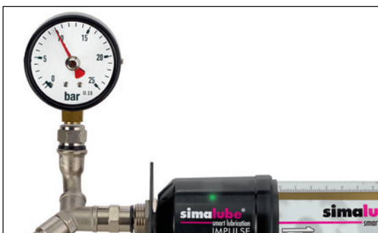
The simalube IMPULSE creates a pressure of up to 10 bar.