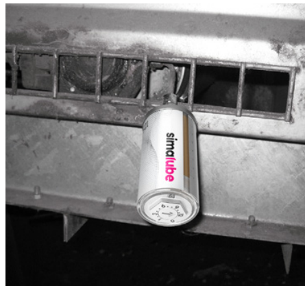
simalube lubricates bearings on a conveyor belt.