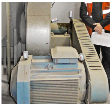
A combustion fan lubricated with two 60 ml and two 125 ml simalube lubricators.