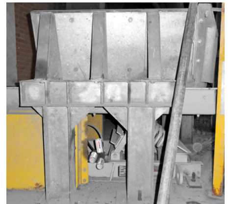
A vibrating conveyor lubricated by several 125 ml simalube lubricators.