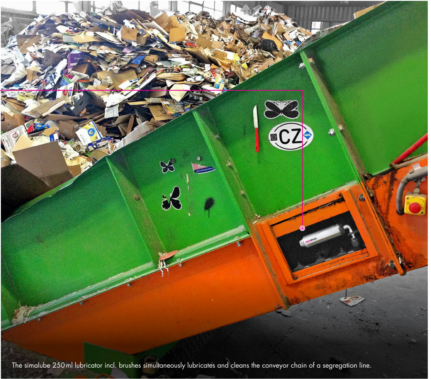
The simalube 250 ml lubricator incl. brushes simultaneously lubricates and cleans the conveyor chain of a segregation line.