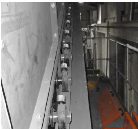
Dozens of 30 ml simalube lubricators provide the bearings of a conveyor belt with the necessary lubricant.