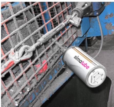
The externally installed simalube prevents dirt from entering the lubrication point.

«simalube increases employee safety in factories»