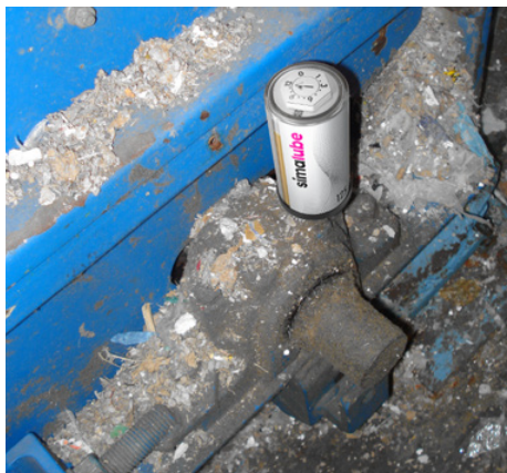
In a paper factory the pedestal bearings of a shredder are lubricated with a 125 ml simalube unit.

«Considerable savings of time and greater safety at work thanks to automatic lubrication»