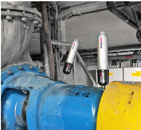
The bearings of the pump are lubricated with two IMPULSE and 250 ml simalube units.