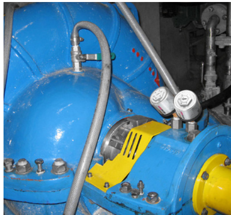
Two 30 ml simalube units lubricate the bearings of a pump.