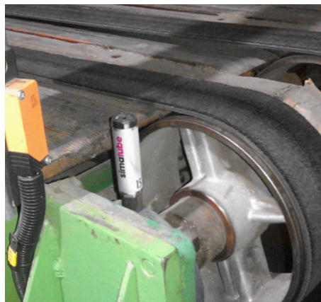
The bearings of the transport belts in a corrugated cardboard factory are continuously lubricated with the simalube lubricator.