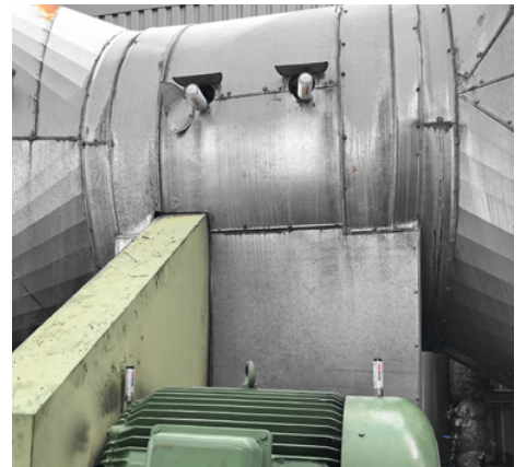
Lubrication of the bearings of a ventilation unit with 125 ml and 15 ml simalube units.