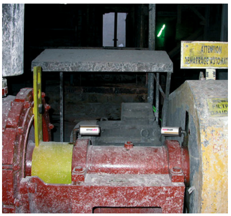
Permanent bearing lubrication on the main drive shaft of a filter pump.