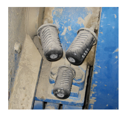
Protective caps used to prevent damage to the lubricator from harsh external conditions.