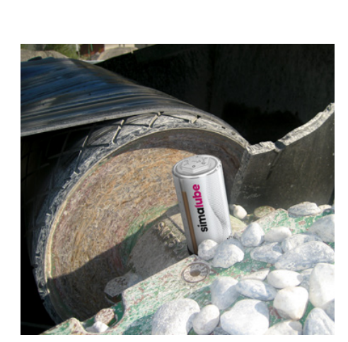
Belt drive lubricated with simalube.

«simalube reduces costs and increases safety in the workplace»