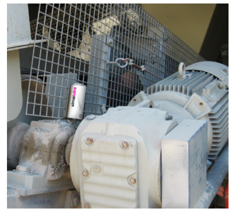
A vertical bearing on a conveyor belt is lubricated with a simalube lubricator.