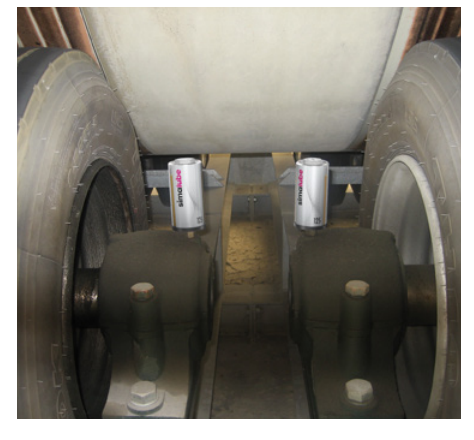
The lubricators are connected directly to the vertical bearing on the drive of a conveyor belt.