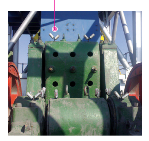
A crusher is lubricated with simalube.