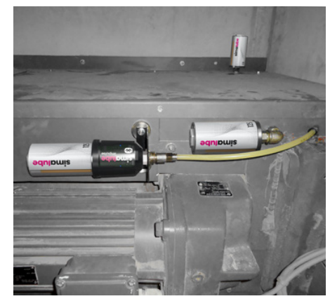
The lubricant is fed to the lubrication point via a long line. A mounting bracket with two magnets fixes the simalube IMPULSE connect to the machine.