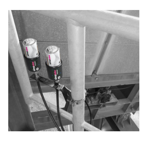
The lubrication points are at a dangerous height. They can be controlled conveniently from the ground with the simatec app.