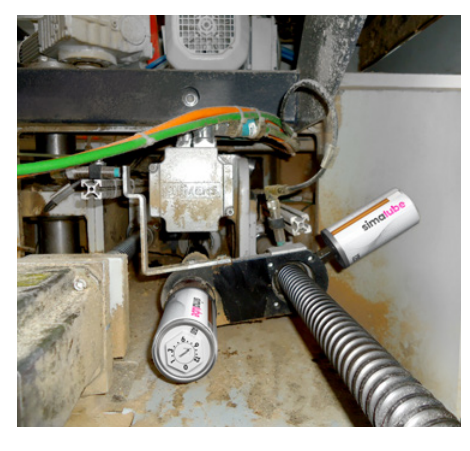
The spindle of a circular saw is reliably lubricated with two 125 ml simalube cartridges.