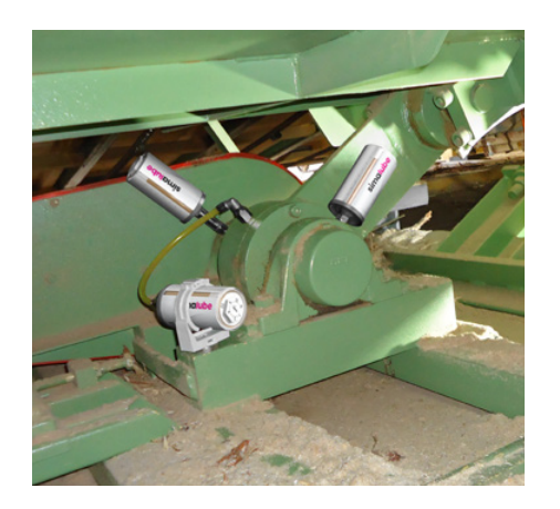
The bearings of a vibration channel are lubricated continuously by three lubricators.

«Considerable saving of time and improved safety in the workplace thanks to automatic lubrication»