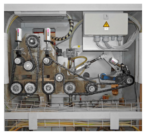
The chains of a cross-cut machine with roll feed are permanently lubricated using three simalube lubricators fitted with brushes and cleaned at the same time.