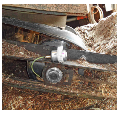
The Y-ball-bearing unit of a conveyor belt is continuously supplied with lubricant.