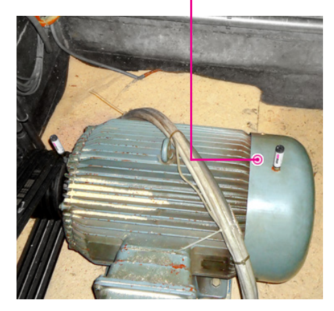
The electric motor of a chipping machine is lubricated in a sawmill.