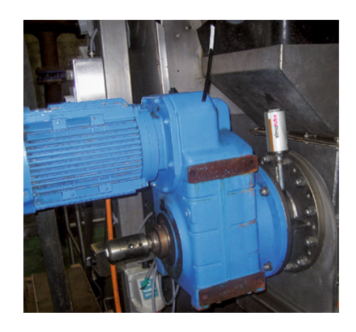
Lubrication of the main shaft of a wash press.

«simalube supports all working processes at wastewater and sewage treatment plants»