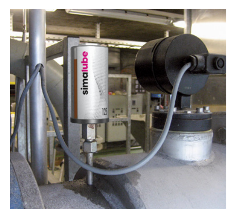
Lubricating bearings: the lubricant is transported to the bearings via a short pipe.