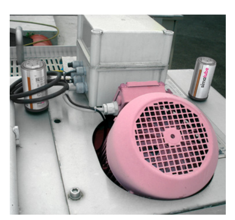
Lubricating conveyor chains with oil. The lubricators are attached to the outside of the housing. The oil is transported to the chain via a tube.