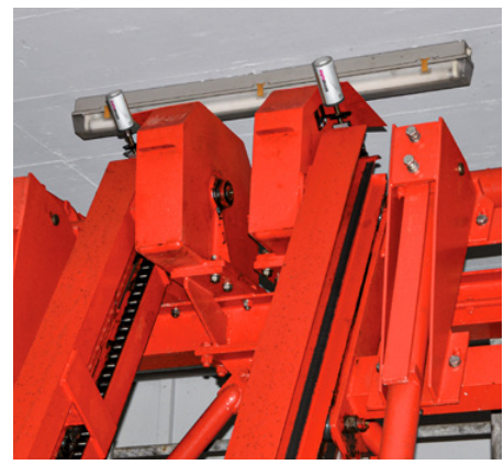
Chain lubrication with simalube on a bar screen equipped with brushes.