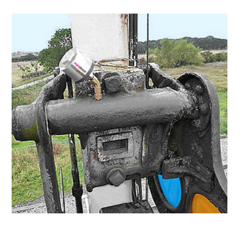
The plain bearing of a railway signal is automatically and continuously lubricated by a 30 ml simalube lubricator.