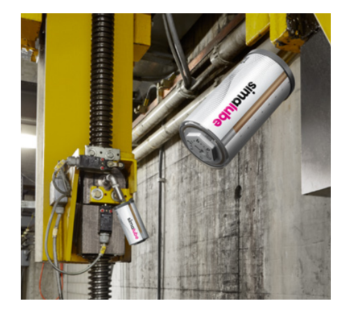
The spindles of a lifting station for railway wagons and locomotives are lubricated with 125 ml simalube over 12 months.

The 125 ml dispenser is installed on the chassis of a low floor tram. The lubricant is directed through a hose to the lubrication point.