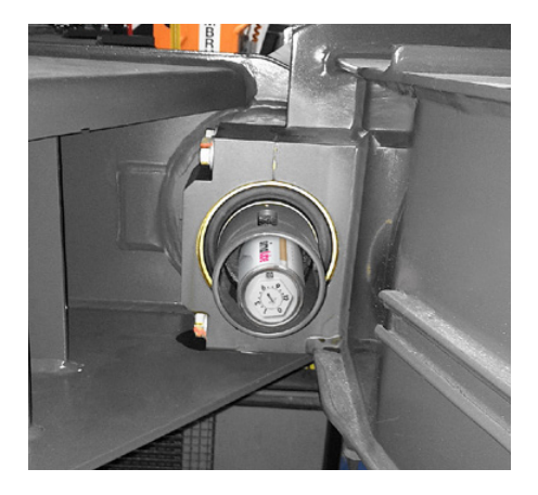
The coupling of two railway cars is lubricated with a simalube 125 ml lubricator.