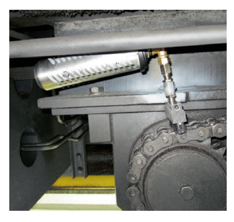
The simalube 250 ml lubricant dispenser lubricates the drive chain of a rail crane. A protective cover protects the dispenser.