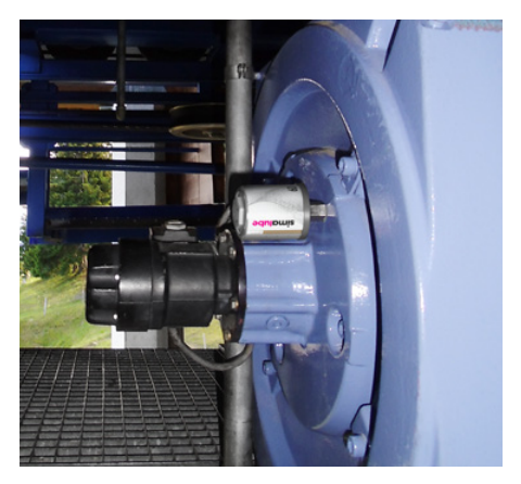
The drive of a gondola lift on the mountain station is lubricated continuously with a 60 ml lubricator.