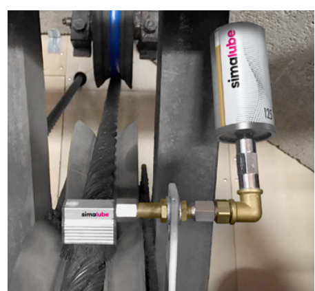
The cable of a cablecar is lubricated by a simalube lubricator. The lubricant is applied with a brush which also cleans the cable.