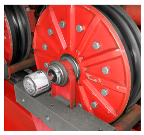
The guide rollers of a mountain railway are supplied with the necessary lubricant.