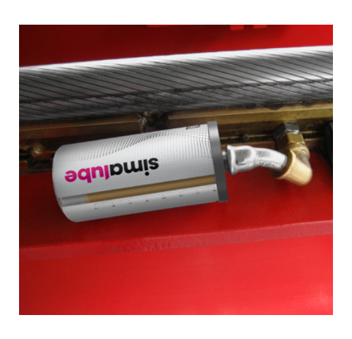
The simalube lubricator is installed directly on the cable saddle and provides constant lubrication.

«Considerable time-savings for maintenance professionals thanks to automatic lubrication»