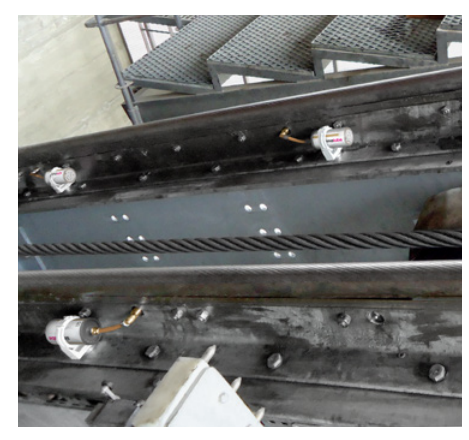
Several lubricators are installed on a cable saddle. Installation is simple thanks to the use of a magnetic clamp.